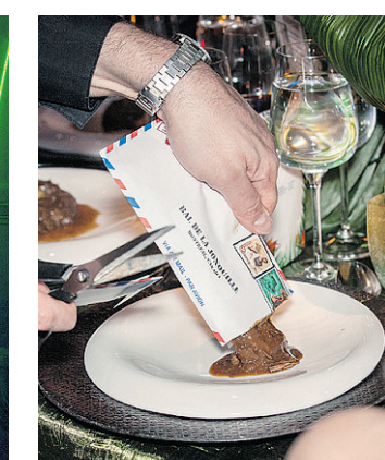
Creative presentation: A main dish of perfect wapiti is