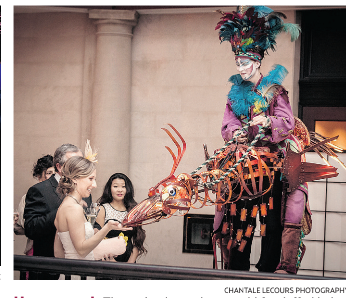
Here you go!: The cocktail crowd goes wild for daffodil-distributing giant bird Dream Hunters.