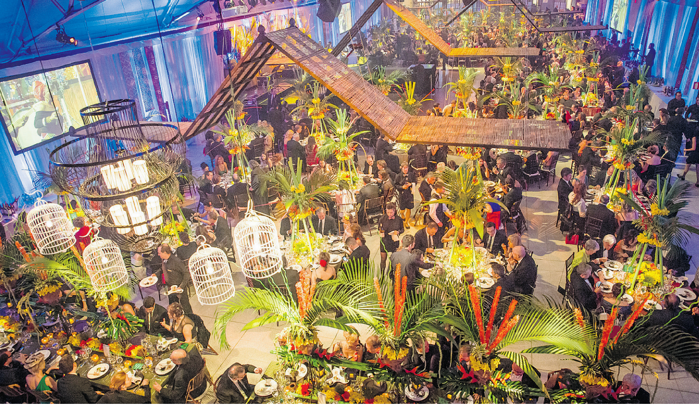
Tent with a view: The cavernous Windsor Station dining room is fiercely reinvented by Décor & More as a spectacular safari tent at the 21st edition of the Daffodil Ball benefiting the Canadian Cancer Society.