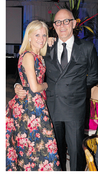
annual Daffodil ball.