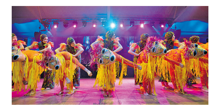
Masked dance: A bevy of dancers from Académie de Danse de Montréal rock a shimmying Lion King-inspired number at the 21st edition of the Daffodil Ball.